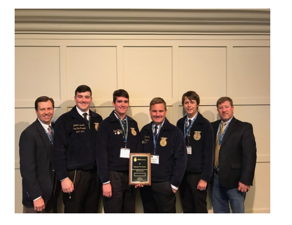
Left: WMHS Farm Business Management Team placed 8th in the NATION!

Right: Chiefland and Williston HOSA students compete at Regionals.