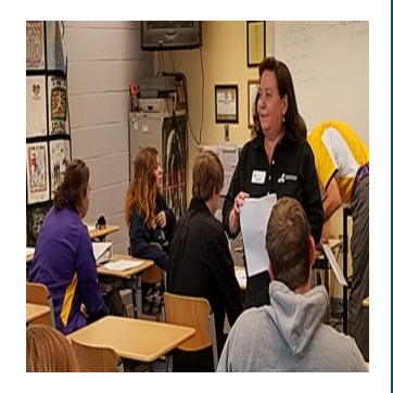
Career Source Staff working on resumes with Cedar Key Seniors

Source on Resume Writing this month. Seniors will create a resume that they can use for scholarship applications college applications, and/or job applications. Career Source has opened a new location in Chiefland and will host an Open House on February 22, 4:00-5:00 p.m. Seniors have received special brochures on the upcoming event.