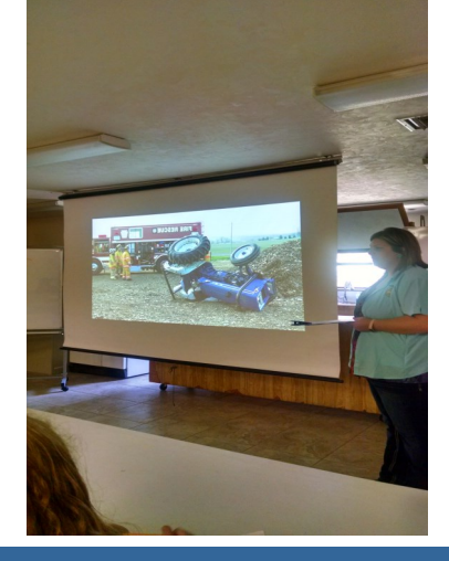
Safety First! This year the Agriscience Middle School students participated in a District-Wide Safety Fair in Bronson.